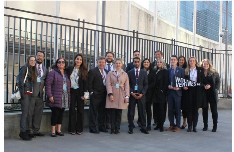
UVU delegation at CSW63 in New York