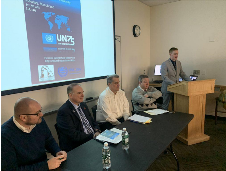
2019 Rotaract President Hosts Panel at 75th Anniversary of the United Nations