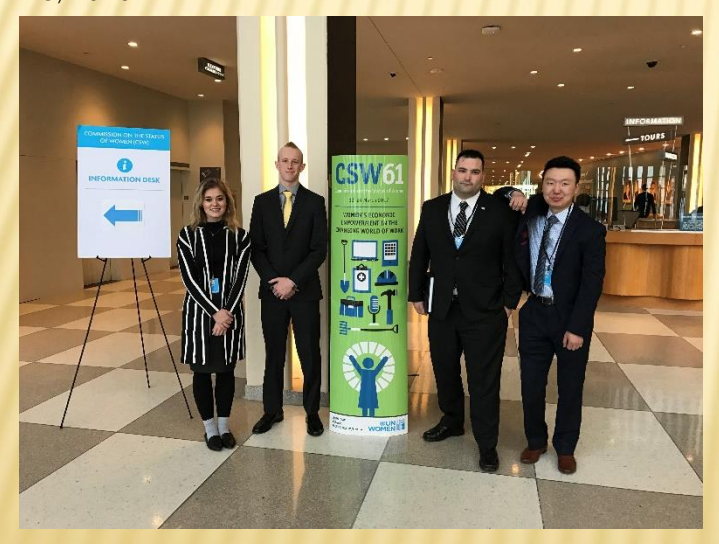
UIMF members at the 61<sup>st</sup> session of the UN Commission on the Status of Women, New York, March 22, 2017